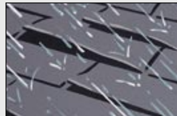
Wind-blown rain trapped under your roof's top layer seeks out those channels.