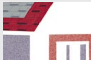
Applying a layer of Moisture Guard Plus to the deck at all rake and eave edges a minimum of 24" beyond the interior wall line will provide a last line of defense against leaks, to help prevent backed-up water from getting into the home.