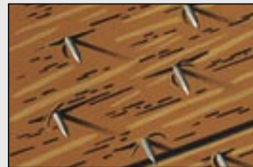
Nail holes and joints in your roof deck provide the channels for water to seep through.